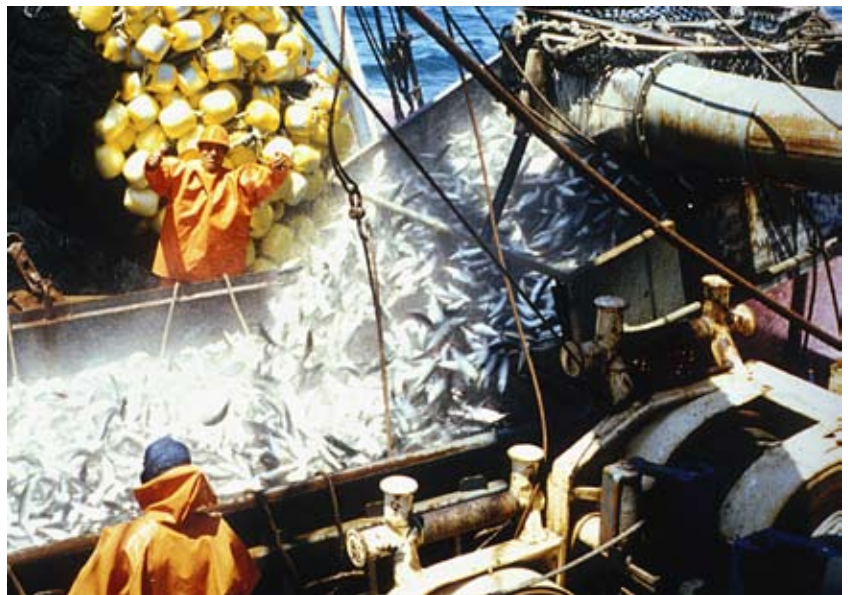
Peruvian seiner harvests chub mackerel. Pelagic species like this have dominated global fish landings since 1950.

While a number of factors such as coastal development, water pollution and climate change have had an impact on marine fisheries, overfishing and destructive fishing practices have been identified as the main driver of the decline of marine and coastal fish stocks. In addition to immediate impacts on fish populations, some forms of bottom trawling, dredging and the use of explosives and fish poisons impact ecosystems by altering the physical environment or changing community structure. Such changes also diminish the ability for these ecosystems to recover.