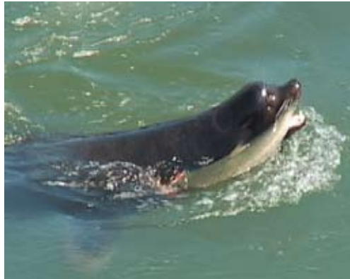
California sea lion taking a Chinook salmon near Bonneville Dam

With spring not only do swallows return to Capistrano but spring Chinook salmon and steelhead return to Columbia River's Bonneville Dam. Once at the dam, the fish